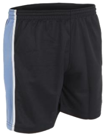
UNISEX PANEL SHORT

ALL TOPS WILL HAVE AN EMBROIDERED SCHOOL BADGE – OPTIONAL FOR STUDENT TO HAVE EMBROIDERED NAME.