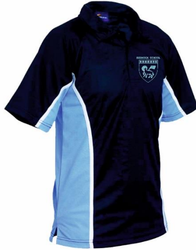
BOYS POLO SHIRT