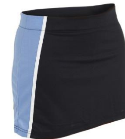
GIRLS PANEL SKORT