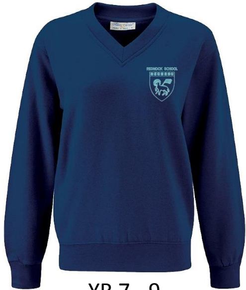
YR 7 - 9

V-NECK SWEAT SHIRT WITH EMBROIDERED SCHOOL BADGE.