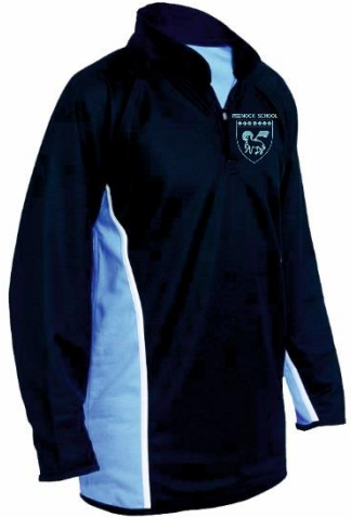
BOYS REVERSIBLE RUGBY SHIRT.