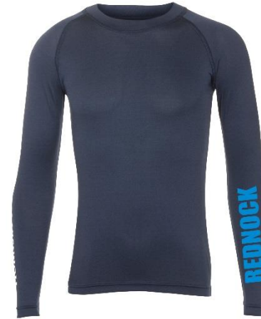
OPTIONAL BASELAYER WITH ARMPRINT.