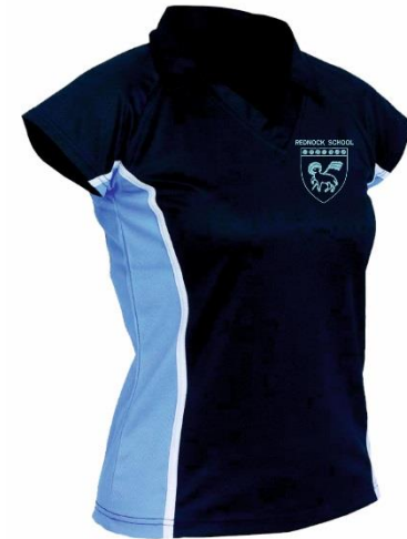
GIRLS POLO SHIRT