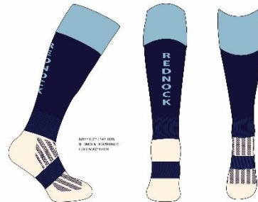
UNISEX CONTOUR SOCKS