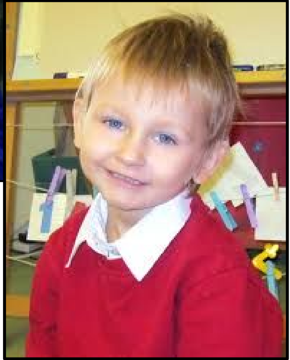
Victoria Climbié 8 years old Peter Connelly 17 months Daniel Pelka 4 years old