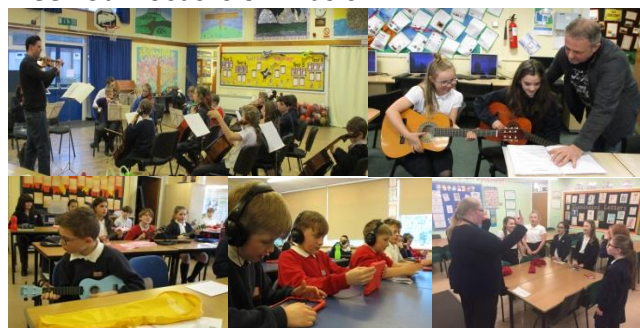
Orchestra, guitar, ukulele, Garage Band and choir

This half term, we're going to share an insight into our broad and exciting curriculum. This week our focus is on music.