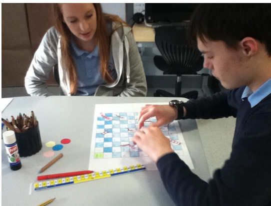
Creating own board game